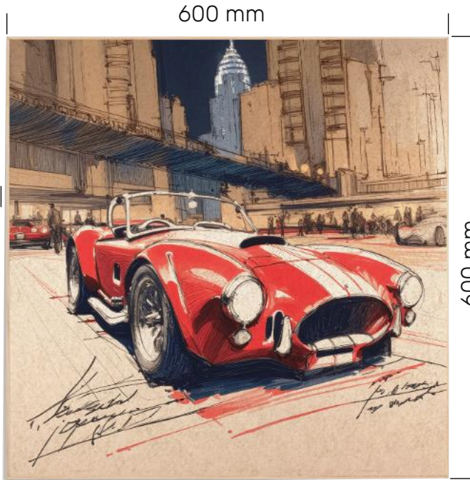
Sample PaintSonic artwork