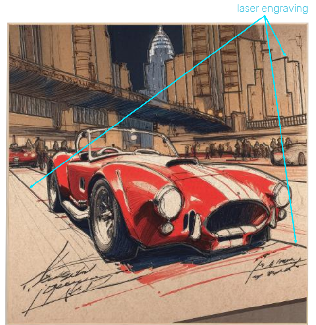
Sample PaintSonic artwork with laser engraving